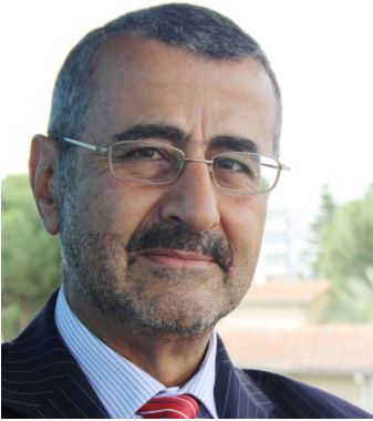
CHARLES ELLINAS SENIOR FELLOW, GLOBAL ENERGY CENTRE, ATLANTIC COUNCIL CYPRUS