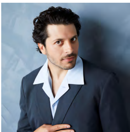
DIMITRI LEONIDAS ACTOR

7 MAY 2026 | 09:55 - 10:15 | CONFERENCE ROOM B